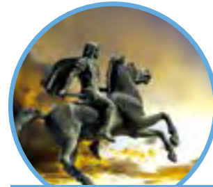
Alexander created many statues of himself.

Can you imagine ruling the entire world? How would you do it? Alexander the Great was a king who wanted to do just that—rule the whole world!