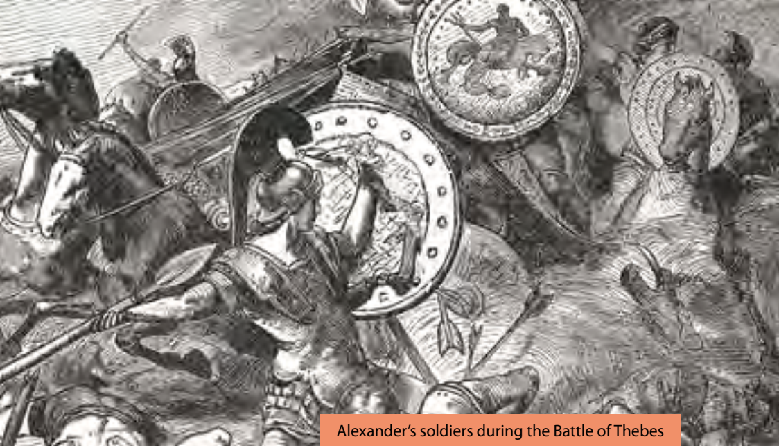
Alexander's soldiers during the Battle of Thebes

King Philip was killed by one of his own soldiers in 336 BC. Alexander became king after his father's death.