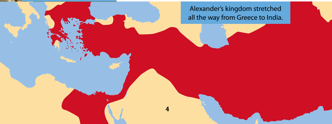
Alexander's kingdom stretched all the way from Greece to India.