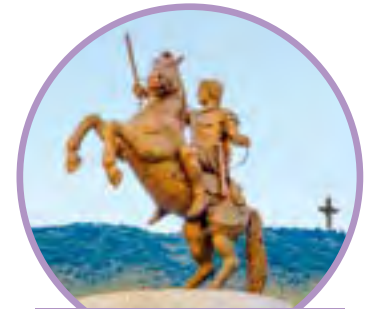
Most statues of Alexander show him riding a horse.

Alexander learned from his father. He was a brave leader, and he made the army even stronger.