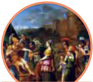
Timoclea of Thebes begs Alexander for her life.

In Thebes, there was more resistance. The people rebelled and rose up against Alexander. In response, Alexander burned the city to the ground. He killed all the men and captured the women and children. After that, many people were scared of Alexander, and no one wanted to challenge his power.