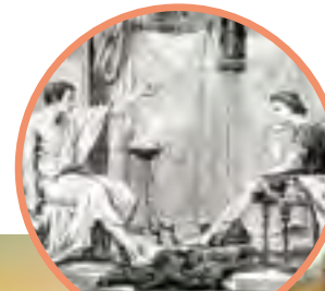
Aristotle and his student Alexander the Great

During his studies, Alexander learned the story of Achilles, a famous fighter. Achilles was strong and courageous. Alexander admired Achilles and wanted to be like him.