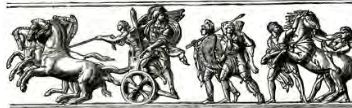
Alexander's army had many soldiers riding horses.